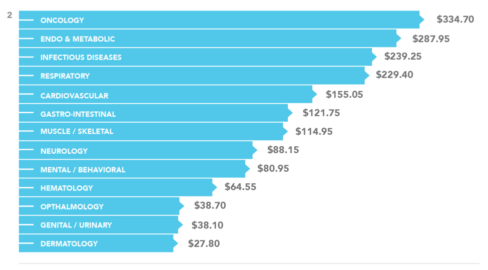
$1,917,550,000 WASTED ON NON-PERFORMING SITES

Assess site feasibility using data regarding patient engagement, previous research methodology, and trial administration, etc. in RWE to allow for more fruitful prospective patient recruitment.