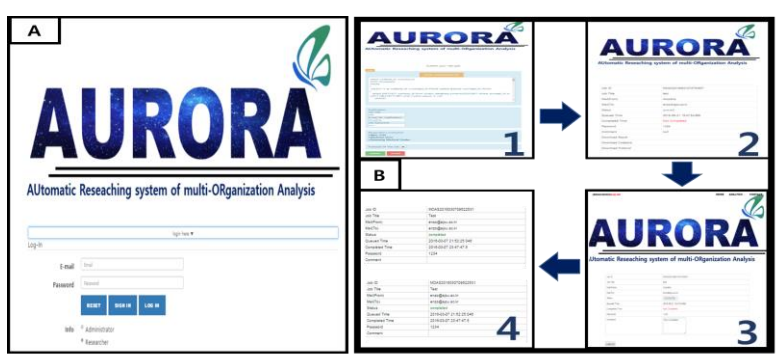
Figure 2. A: Main page of AURORA. B: Overview of research process in AURORA, 1. AURORA send email containing the analysis code generated from Code generator and research protocol written by researcher to administrator 2. After email sending, researcher can check out the status of jobs. 3. Administrator can update the status. (e.g., 'Not completed' to 'Completed') 4. Researcher can confirm updated job status.

Figure 2 shows the AURORA user interfaces.